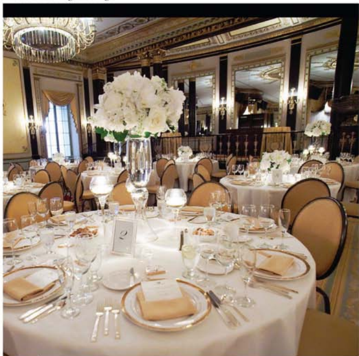
The ceremony and reception were both held in the Empire Room at The Palmer House. Gold bengaline silk napkins from BBJ Linen complemented the room's traditional design.