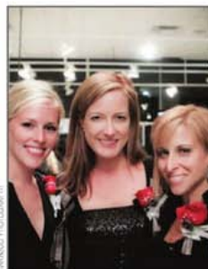
SON PRESENTS 'GROOM SERVICE'