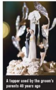
A topper used by the groom's parents 40 years ago