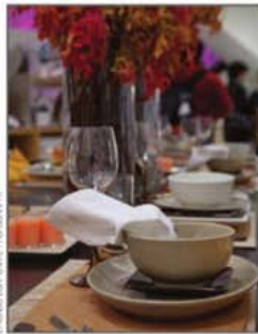
BLOOMINGDALE'S COUPLES' NIGHT OUT