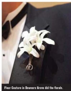
Fleur Couture in Downers Grove did the florals.