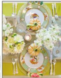
SIP, SEE AND SAVOR EVENT