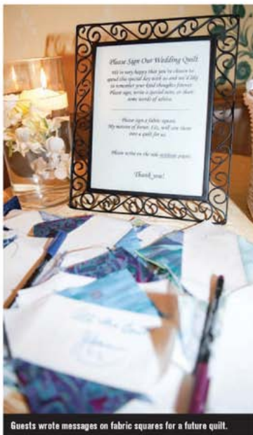
Guests wrote messages on fabric squares for a future quilt.