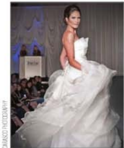
LUXURY BRIDAL EXPO