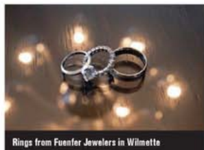
Rings from Fuenfer Jewelers in Wilmette