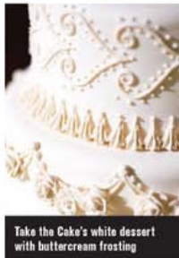
Take the Cake's white dessert with buttercream frosting