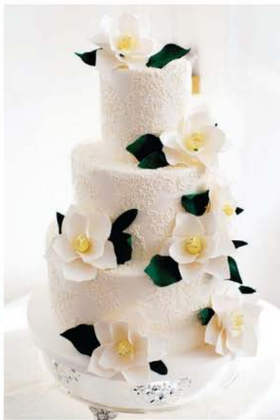
The almond butter dessert by Cake: Sweet Food Chicago

THE PARTY Ensemble band The Party Faithful played the couple's first song, "Everlasting Light" by The Black Keys. Later, Alex's brother "Chicago Dan" took an amazing turn on the harmonica. —EH