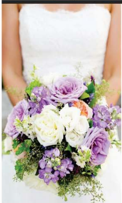
The bride's bouquet by Hello Darling featured four kinds of roses mixed with fresh lavender sprigs and eucalyptus.