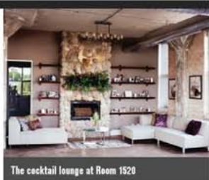
The cocktail lounge at Room 1520