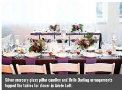
Silver mercury glass pillar candles and Hello Darling arrangements topped the tables for dinner in Aérée Loft.