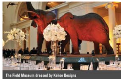
The Field Museum dressed by Kehoe Designs