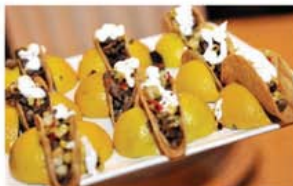
Late-night snacks of mini carne asada tacos by Blue Plate