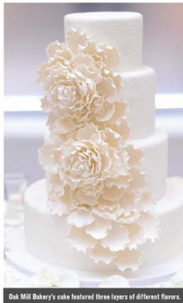
Oak Mill Bakery's cake featured three layers of different flavors.