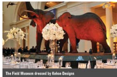
The Field Museum dressed by Kehoe Designs