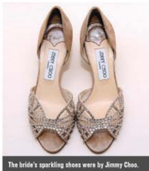
The bride's sparkling shoes were by Jimmy Choo.