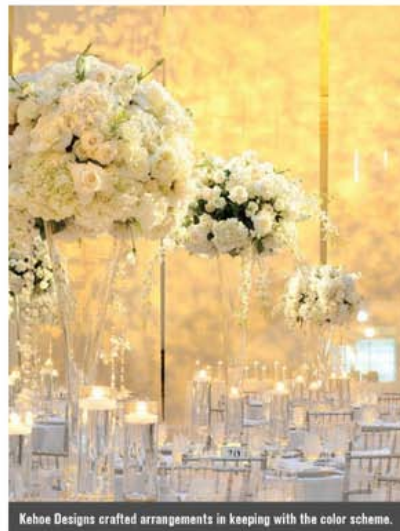
Kehoe Designs crafted arrangements in keeping with the color scheme.