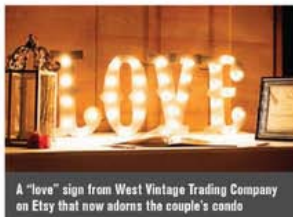
A "love" sign from West Vintage Trading Company on Etsy that now adorns the couple's condo