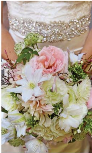
The bride's bouquet by Fleur featured garden roses, clematis, jasmine, Astrantia, phlox and dahlias.