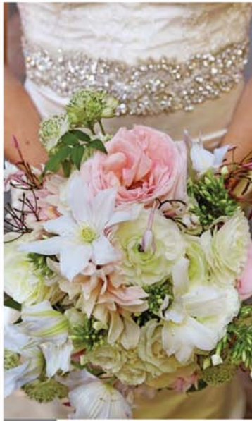
The bride's bouquet by Fleur featured garden roses, clematis, jasmine, Astrantia, phlox and dahlias.