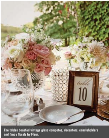
The tables boasted vintage glass compotes, decanters, candleholders and fancy florals by Fleur.