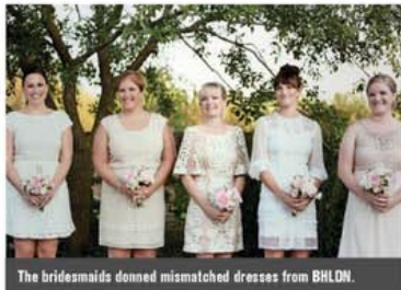
The bridesmaids donned mismatched dresses from BHLON.