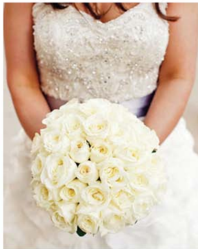
The bride's white rose bouquet