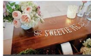
The "Sweetie Pie" table housed escort cards by Lily Red Studio.