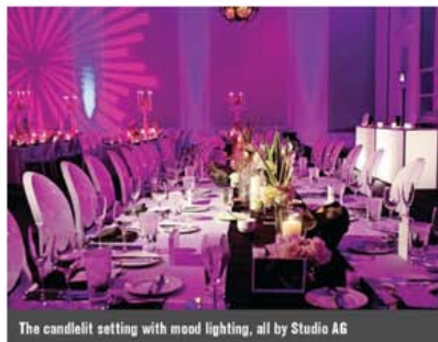
The candlelit setting with mood lighting, all by Studio AG