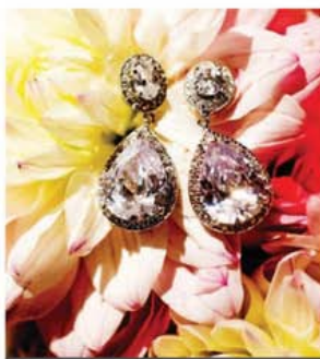
Pear-shaped earrings by Tigerlilly