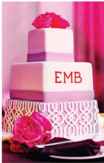
The monogrammed square cake by TipsyCake